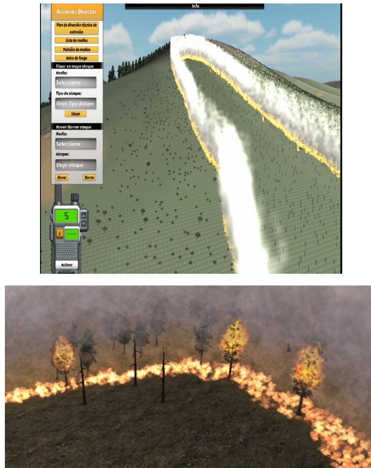
Figure 3 - ERVIN simulation screenshots