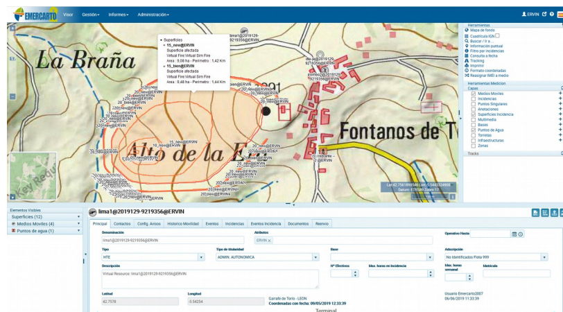
Figure 4 - EMERCARTO platform screenshot

final outcomes from calculations, such as perimeters of fire related to time intervals and fire statistics.